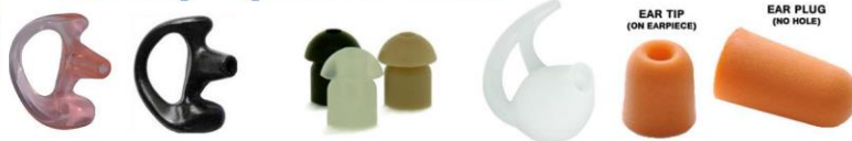
EAR TIP (ON EARPIECE)